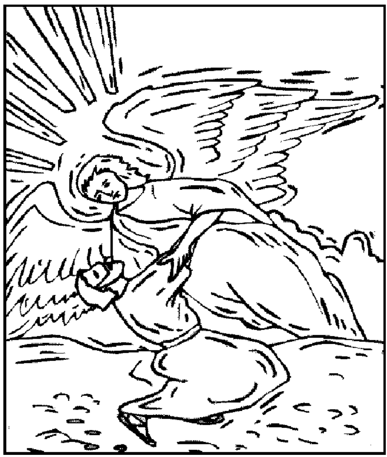
Jacob Wrestles with God Genesis 32: 3 - 33: 7